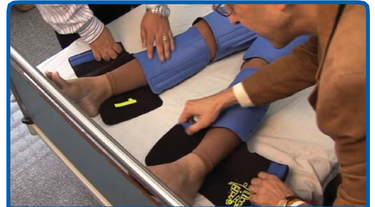
Open segment pair #1 (#2 for short women)