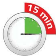
Wait 15 minutes