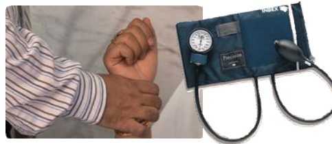
Take pulse & BP