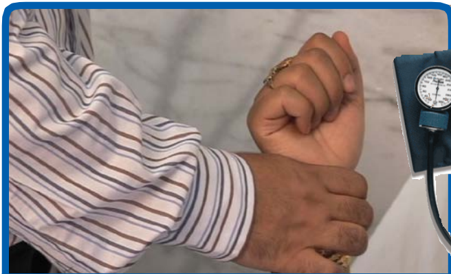
Take woman's pulse & BP

Always wear gloves when touching a soiled NASG.