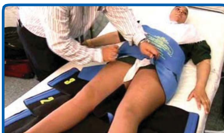
If no change >20 in pulse or BP, open segment #4