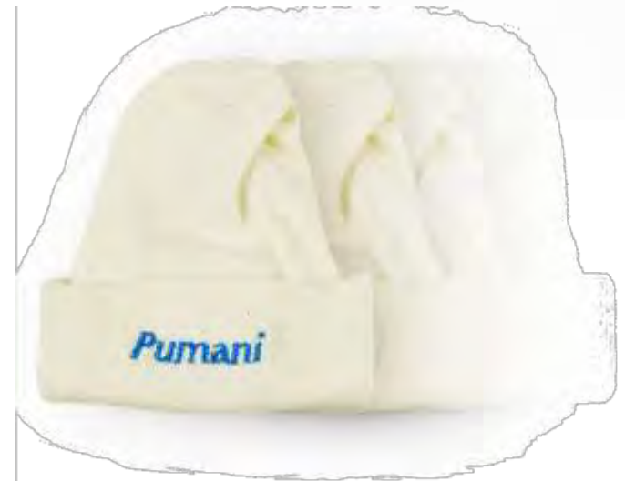
Pumani Hat, Size - Large