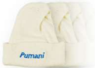
Pumani Hat, Size - Small

Pumani Accessory Items – Ordering Instructions