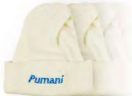
Pumani Hat, Size - Medium